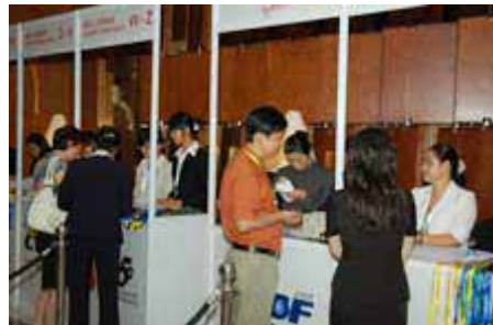
Conference Registration and Reception