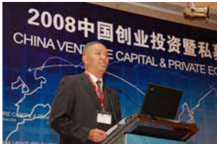
Qi Cai, HangZhou Municipal People's Government, Mayor