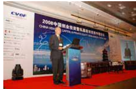
Qi Cai, HangZhou Municipal People's Government, Mayor