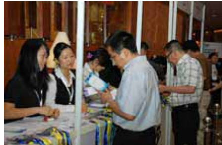
Conference Registration and Reception