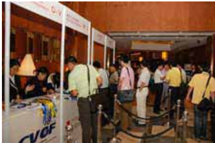
Conference Registration and Reception