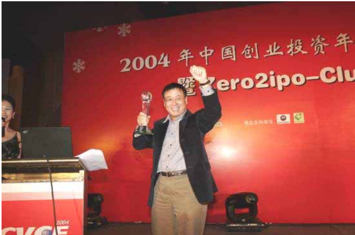
Venture Capitalist of the Year