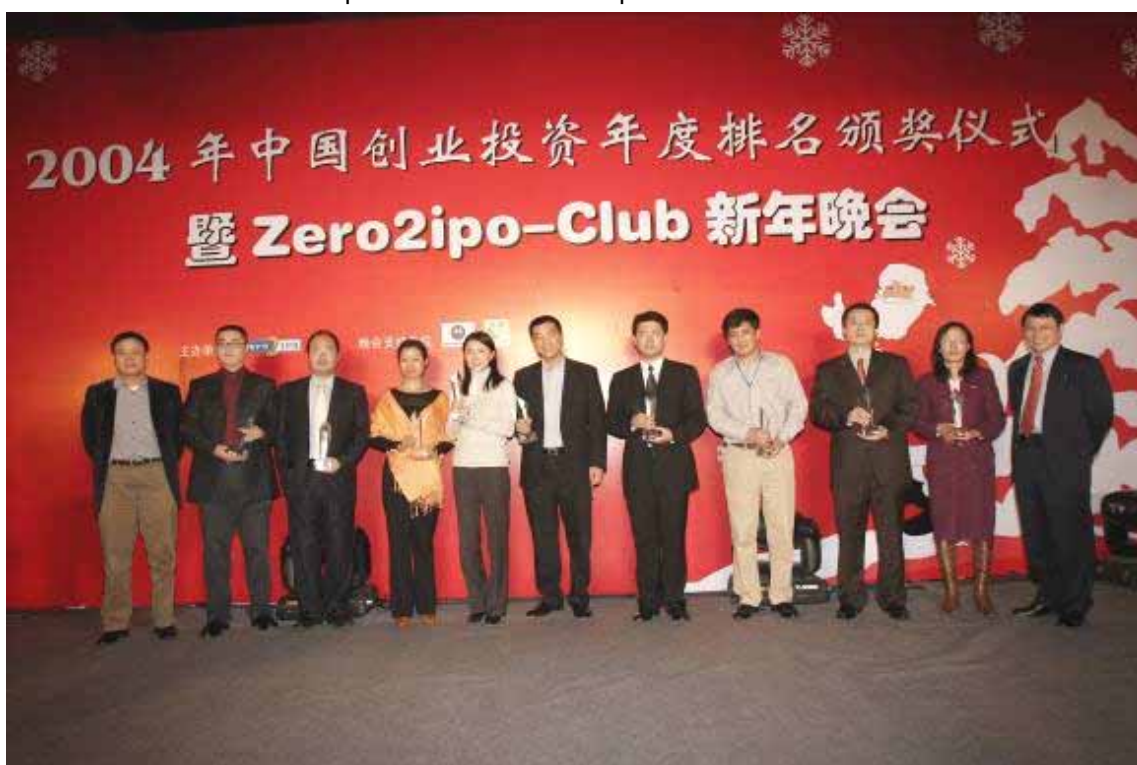
Top 10 Venture-backed Entrepreneurs 2004