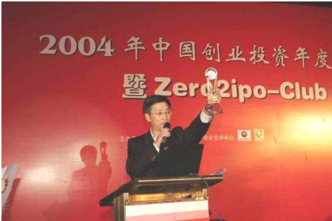
Venture Capital Firm of the Year