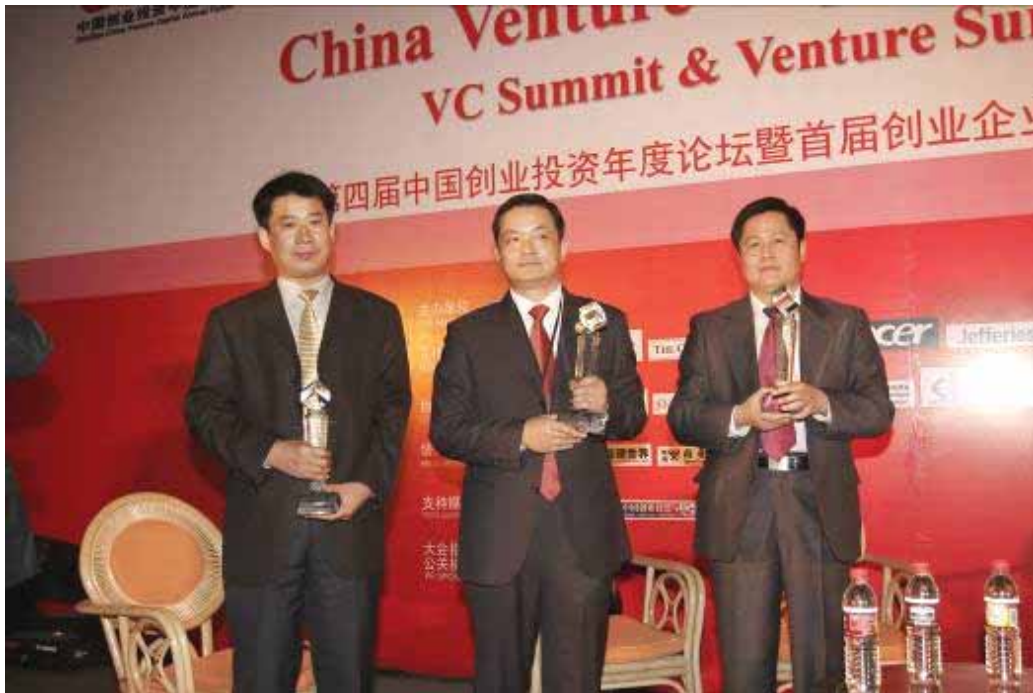
Ceremony of Awards of 2004 Venture Competition

Session 6: Let's talk about the Real Return