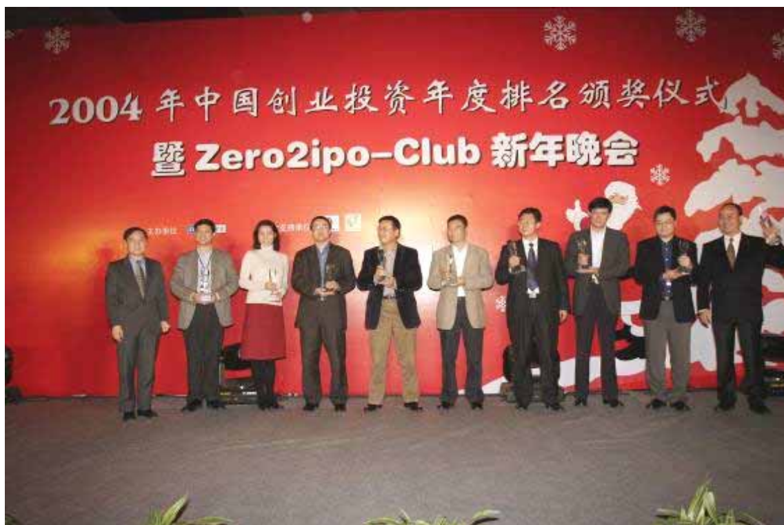
Top 10 Active Venture Capitalist of the Year